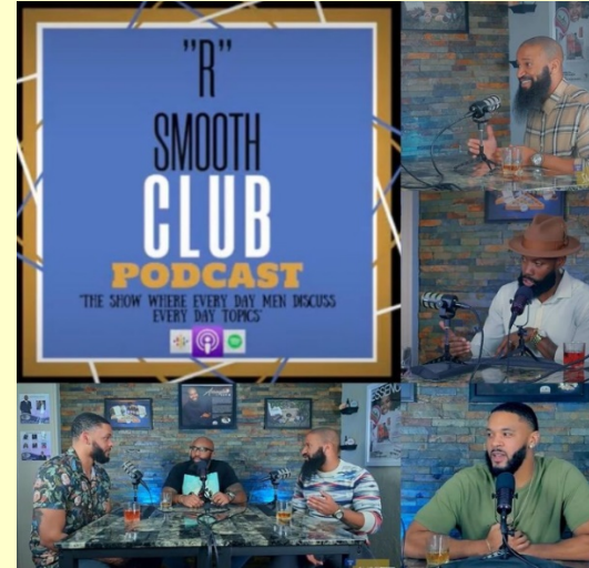
“R” Smooth Club Podcast